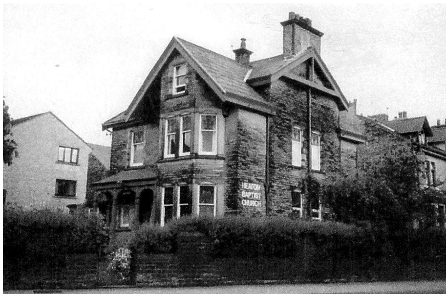
The Manse (new Baptist Church), Heaton