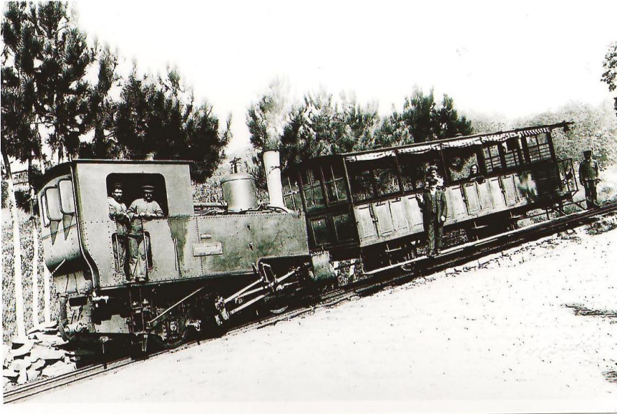
Madeira Railway – 4 postcard views