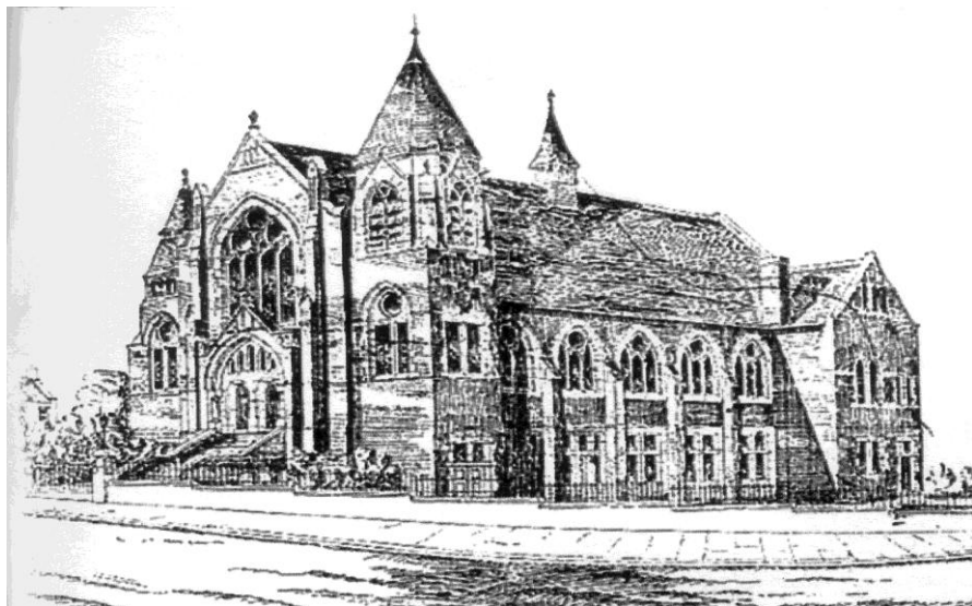
The old Baptist church at Heaton