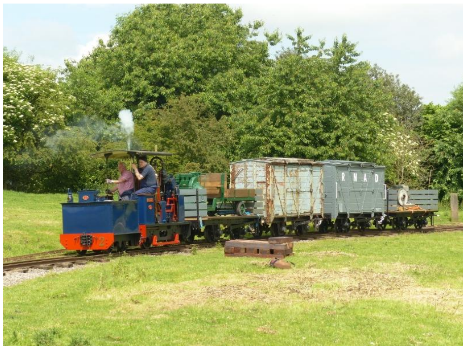
Amerton n.g. railway, 14 th June 2014 (both photos)