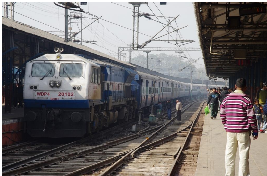
2nd Feb 2014 - 20102 Delhi Jct.