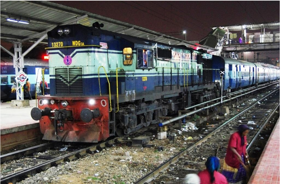
22nd Jan 2014 - 13270 Bangalore City Jct.