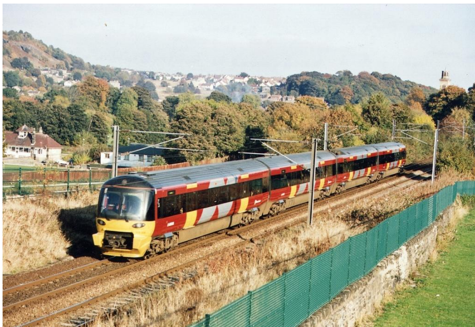
Cl.333 emu north of Saltaire station, October 2003