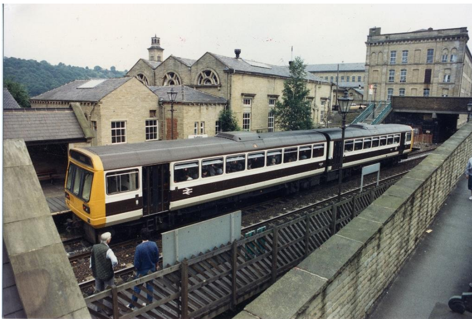
Saltaire Station June 1988