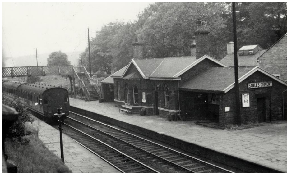
Saltaire station 28 June 1955