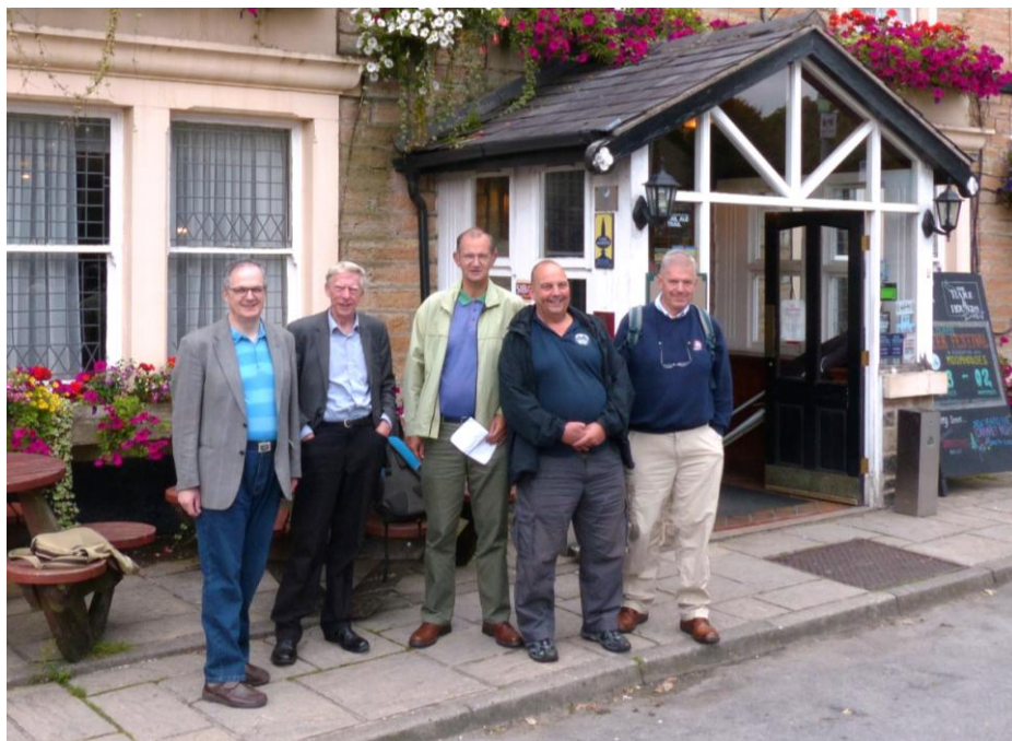
BRC Outdoor Visit group, 3 rd Sept 2014