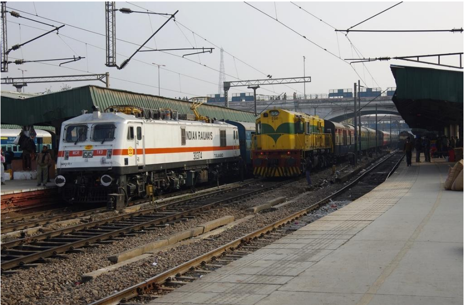
24th Jan 2014 - 30374 New Delhi