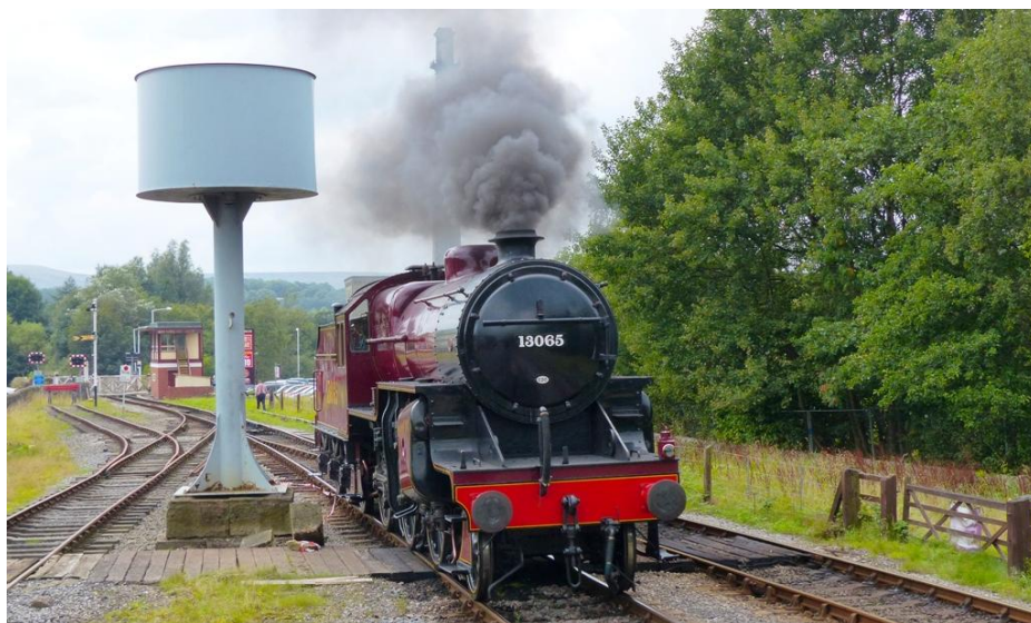
LMS "Crab" 2-6-0 13065 at Rawtenstall, East Lancs Railway , 3/9/2014