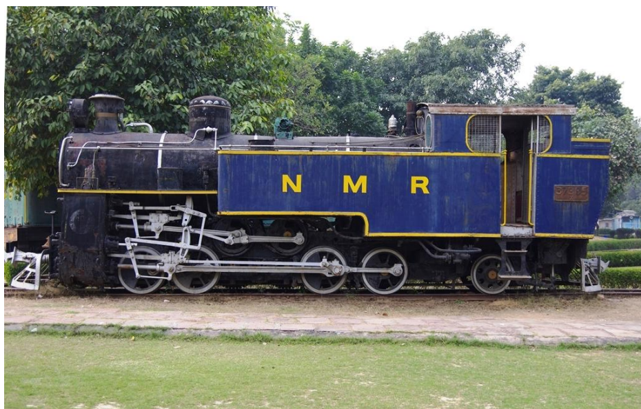
6th Feb 2014 – 37385, National Railway Museum, New Delhi