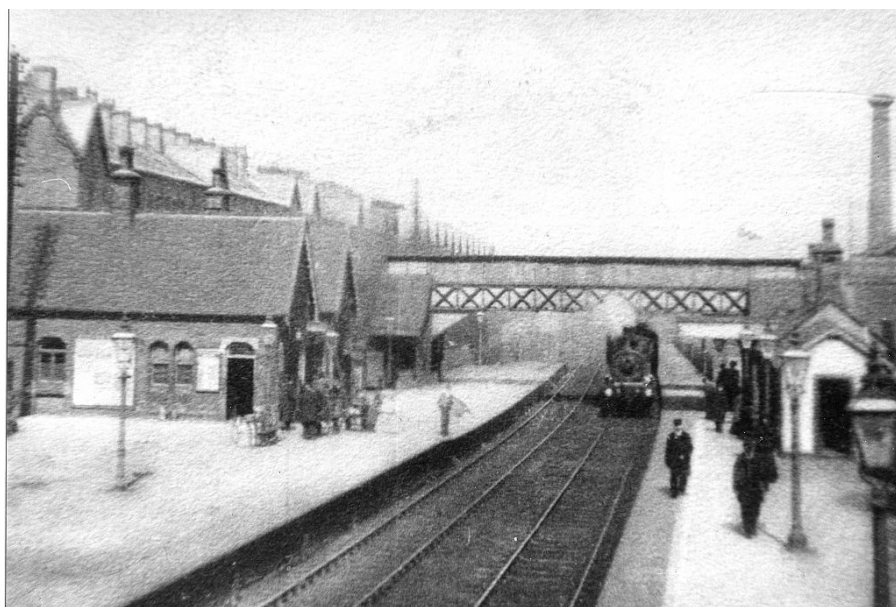
Saltaire station around a century ago