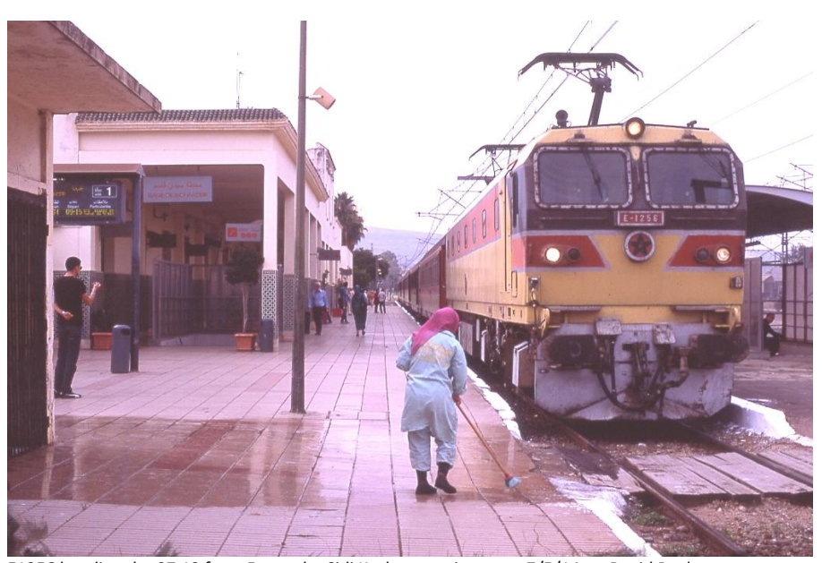
E1256 heading the 07.10 from Fez at the Sidi Kachem station stop, 7/5/14 David Peel