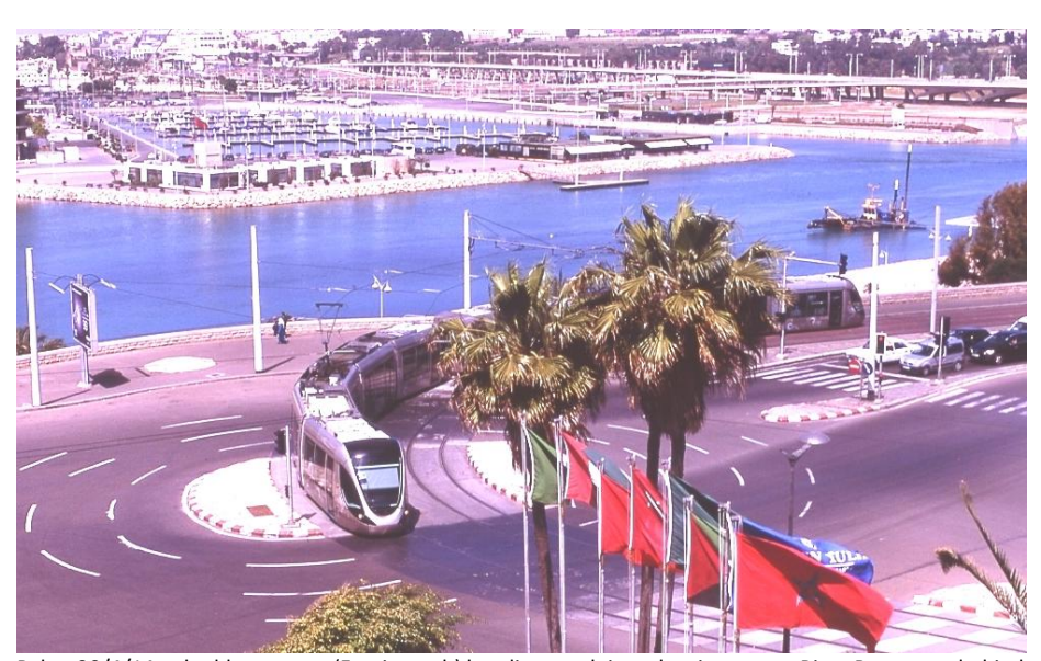
Rabat 30/4/14: double tram set (5 units each) heading south into the city centre. River Bouregreg behind, district of Sale in the distance and the Atlantic to the left David Peel