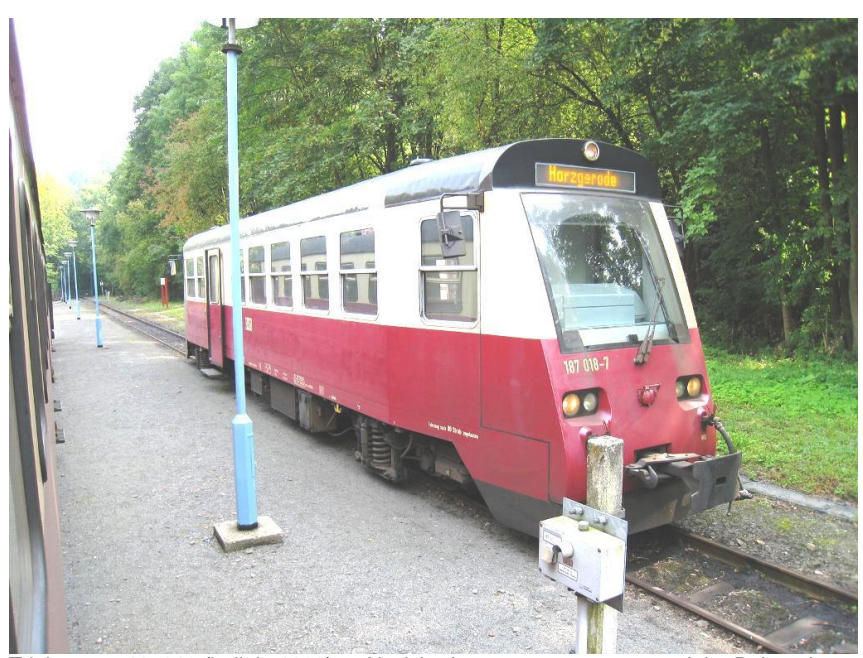
Triebwagen 187018 (built in 1999) at Alexisbad