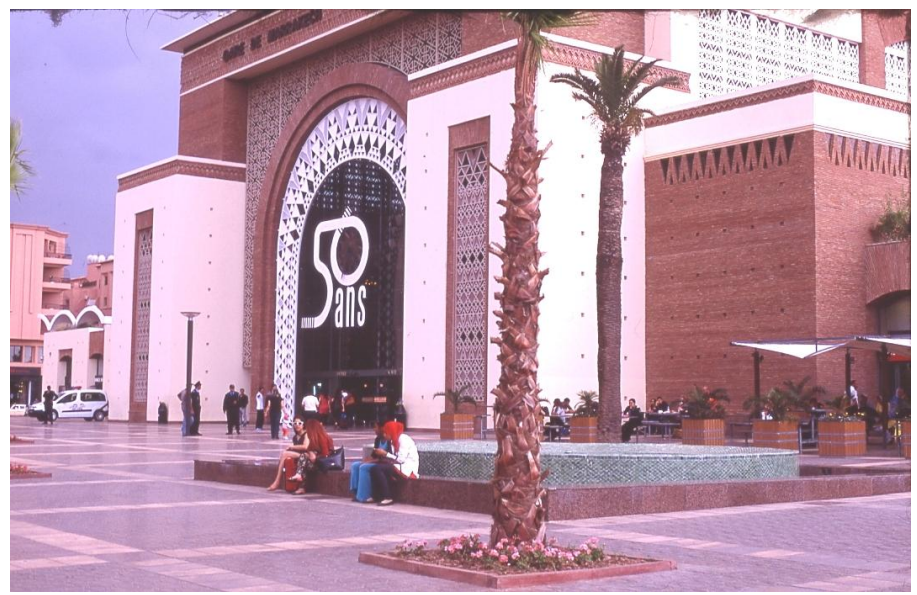
Marrakech: station exterior 2/5/14