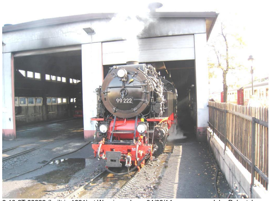
2-10-2T 99222 (built in 1931) at Wernigerode on 04/09/14