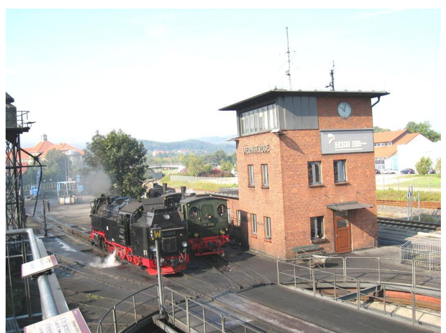
Wernigerode Signal Box & yard