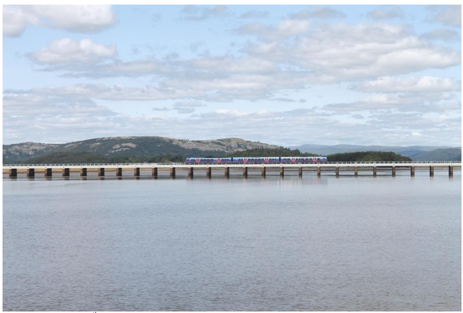
Arnside Viaduct – 14<sup>th</sup> July 2015