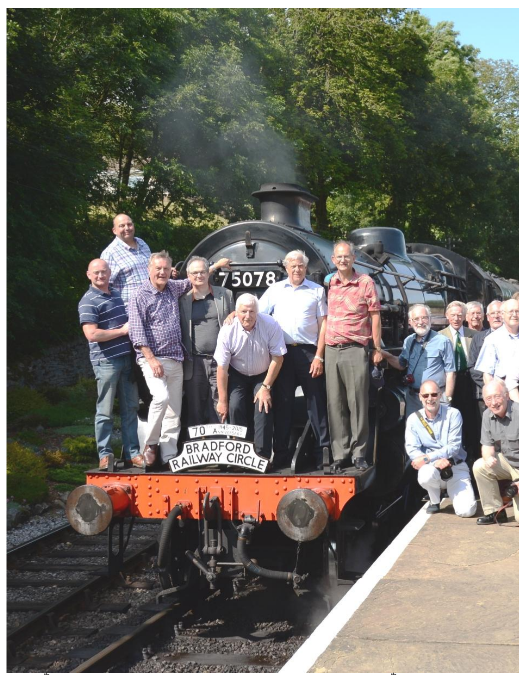
BRC 70<sup>th</sup> Anniversary – Oxenhope Station, Keighley & Worth Valley Railway – 12<sup>th</sup> July 2015