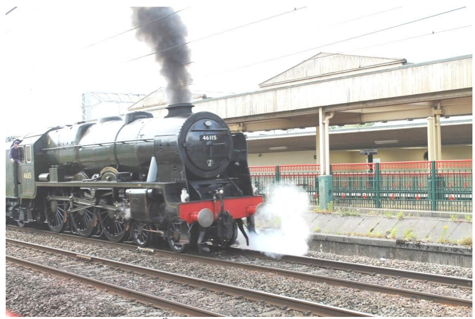
"Scots Guardsman" at Carnforth 11th July 2015