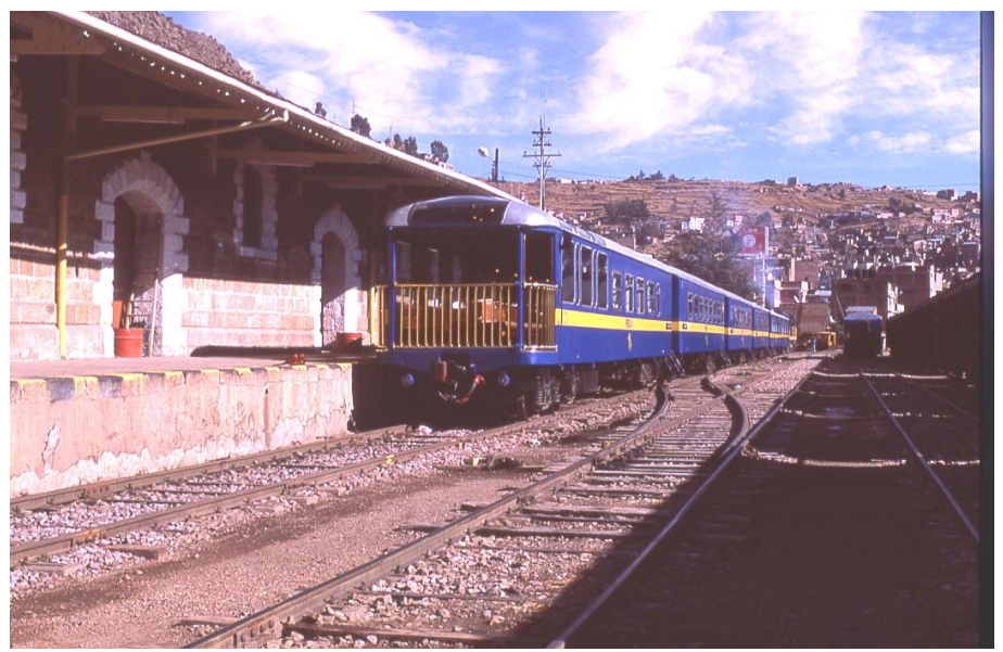
Wed 17/9/14 Puno station, showing the observation deck of the rear lounge/bar car in the northbound Andean Explorer set. Dave Peel