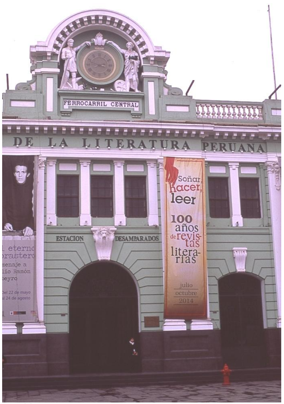
Wed 10/9/14 Exterior of Lima's main long distance station Desamperados, now used only 3 or 4 times a year on religious festival days. Dave Peel