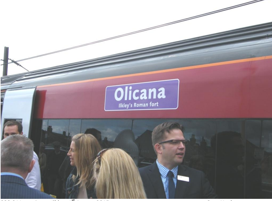
333 011 naming at Ilkley, 1<sup>st</sup> August 2015